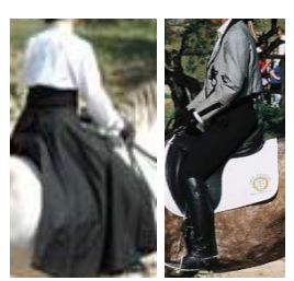
12 points PART DRESS