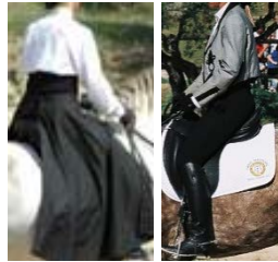
12 points PART DRESS