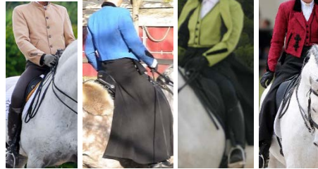
14 points with classical boots and trousers