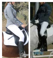
Classic dress : 8 points