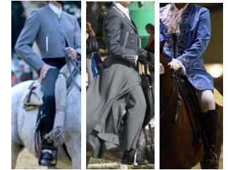
16 points FULL DRESS