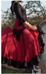
10 points FOLK DRESS